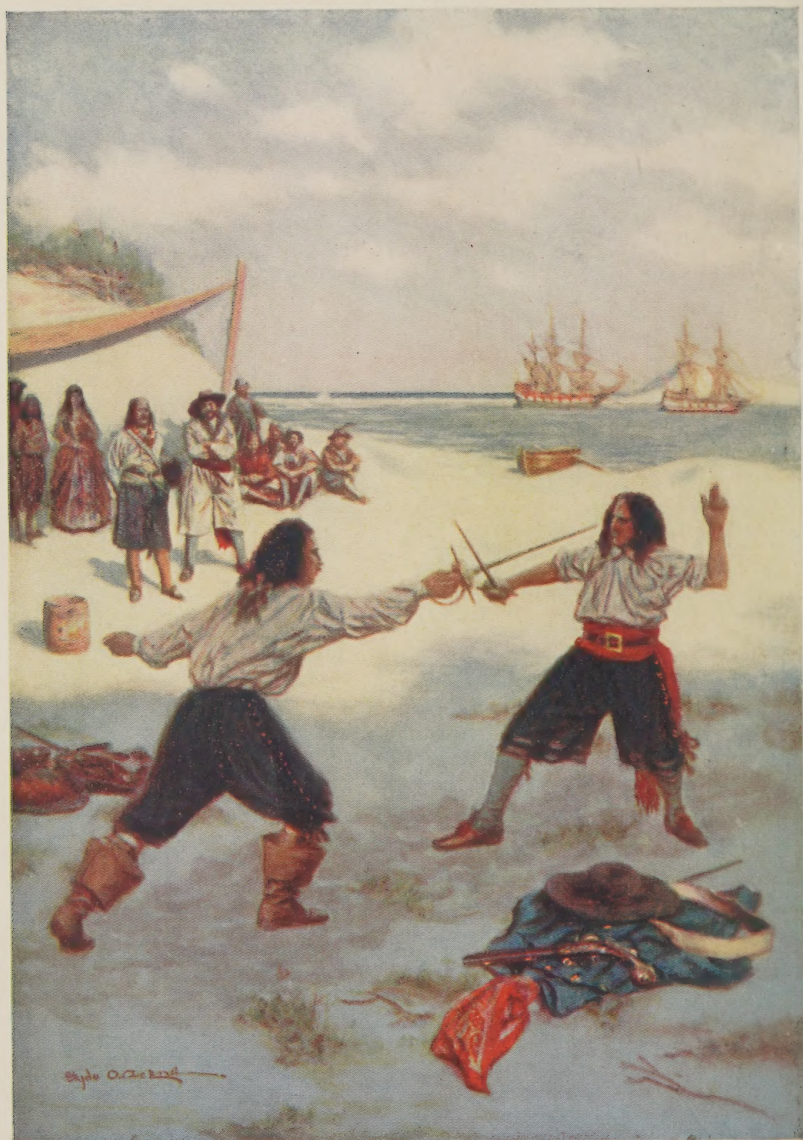
THE BLADES RANG TOGETHER (page 205)